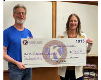
Gladstone-Rapid River Kiwanis Club

Thank you to the Remnants Barber Shop Quartet who donated a monetary gift to continue our services.