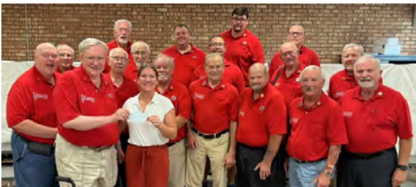
Remnants Barber Shop Quartet

Thank you to the following for your financial gifts: Berean Baptist Church, Community Foundation for Delta County, Delta Church, Donald & Audrey Anderson Foundation, Heart of the North Lions, John & Melissa Besse Foundation, Knights of Columbus of Bark River, Knights of Columbus of Escanaba, Knights of Columer of Gladstone, Lighthouse Church, New Life Church and Trinity Lutheran Church.